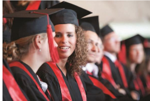
Graduation ceremony

The Faculty of Law and Economics and its teaching staff are of high national and international repute. All parts of national and international law are lectured here on a high academic level.